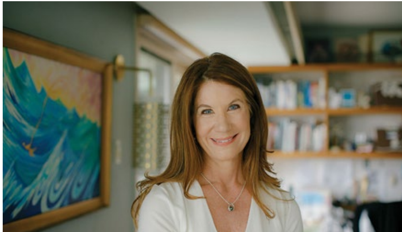
PHOTO: The #1 New York Times bestselling author brings us her most ambitious and provocative work yet—a searing and timely novel that explores the most volatile issue of our time—domestic violence—and the sustaining power of women's friendships.